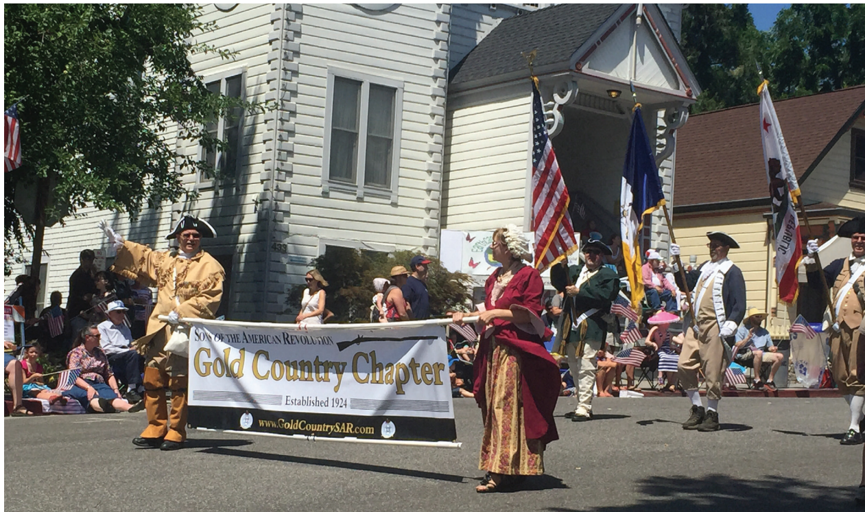
Gold Country Chapter Color Guard in the Fourth of July Parade

The Forty Niner Gold Country SAR 5701 Lonetree Blvd Suite 301 Rocklin, CA 95765