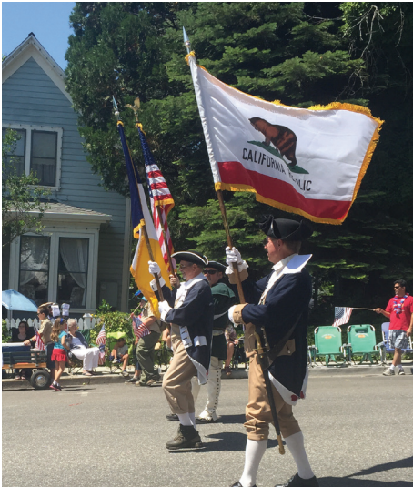
Fourth of July Parade Gold Country Chapter Color Guard