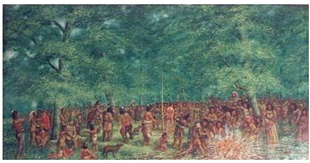
Burning of Colonel Crawford, Frank Halbedel, 1915

killed and tortured by Indians in the Battle of Sandusky, 1782.